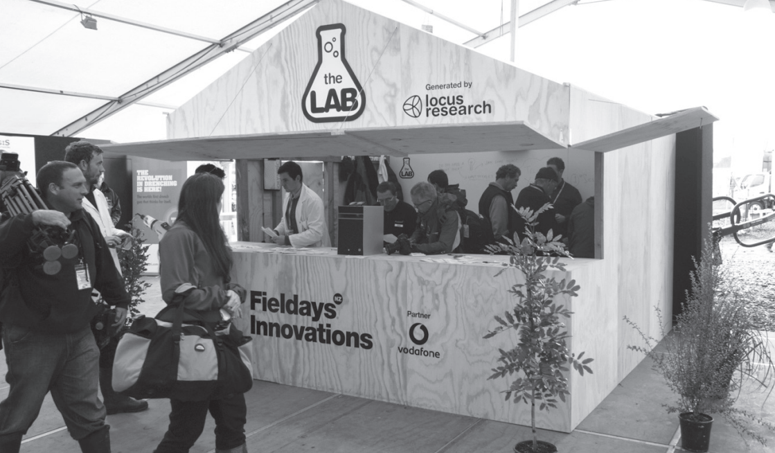
The original Lab in 2014/15. Stop by to see the new and improved Lab in the Innovation Centre.